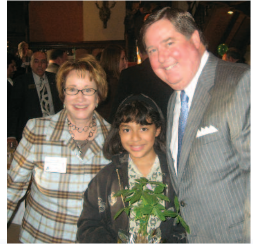
REP. CALVERT meets with a young constituent and discussed the importance of education, after speaking at a local Chamber of Commerce event about legislative business.

No more bailouts! Government spending is out of control and has created trillions in new debt over the next ten years. Rep. Calvert voted against the stimulus; auto bail out; mortgage bail out; the nearly $4 trillion budget; as well as other irresponsible spending bills. Congress must rein in spending.