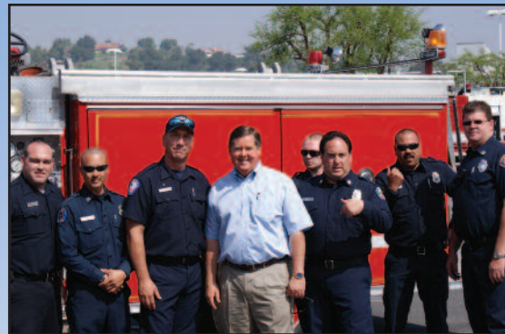
REP. CALVERT meets with First Responders in the district to discuss federal, state and local coordination in the event of an emergency.

Rep. Ken Calvert 2201 Rayburn HOB Washington, DC 20515